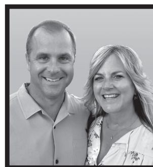
Oregon Licensed Real Estate Brokers