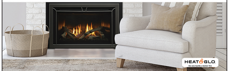
Pictured: Heat & Glo Cosmo I-35 with Iron Age Front and Fluted Black Glass Liner