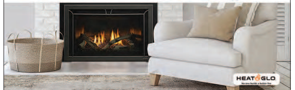
Pictured: Heat & Glo Cosmo I-35 with Iron Age Front and Fluted Black Glass Liner