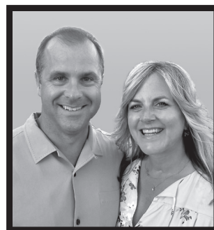
Oregon Licensed Real Estate Brokers