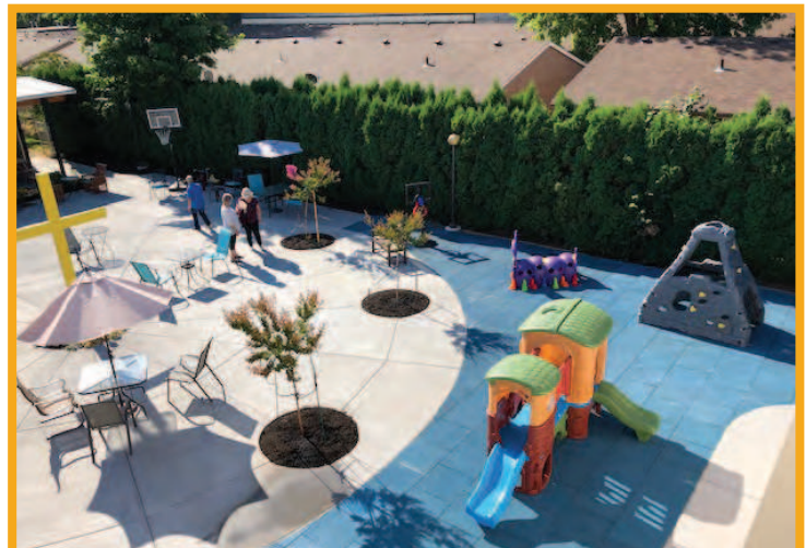
Playground at Simonka Place, a women's and children's shelter