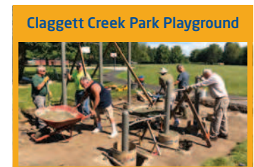
Claggett Creek Park Playground

Keizer Rotary is nothing without you! Our local club is made up of individuals sharing a common cause, serving others above self.