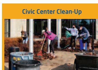
Civic Center Clean-Up