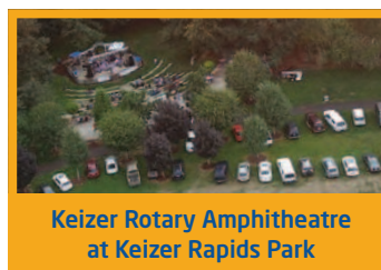
Keizer Rotary Amphitheatre at Keizer Rapids Park