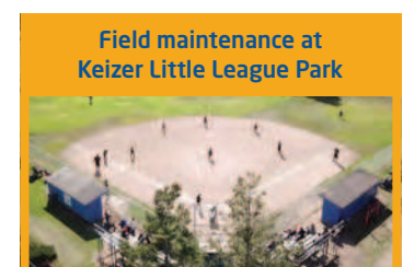
Field maintenance at Keizer Little League Park

Rotary bars no one because of race, creed, sex, sexual orientation or national origin. We encourage our members to take an active interest in government, civic and community affairs, but do not condone Rotary to be used for politics, conducting business or support for any particular faith or special interest. Rotary is a place for community leaders and people of goodwill, to connect weekly with a common goal of understanding and meeting the needs of our community.