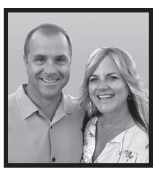
Oregon Licensed Real Estate Brokers