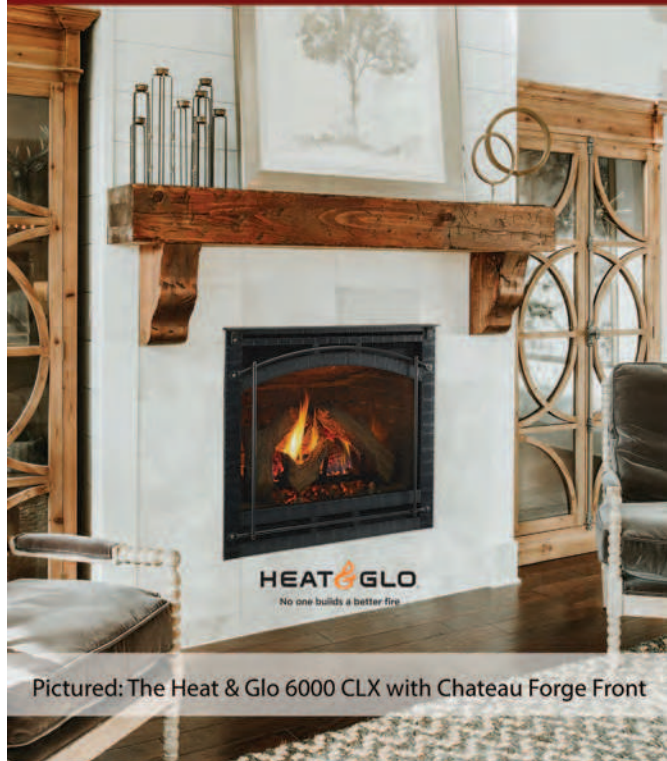
Pictured: The Heat & Glo 6000 CLX with Chateau Forge Front