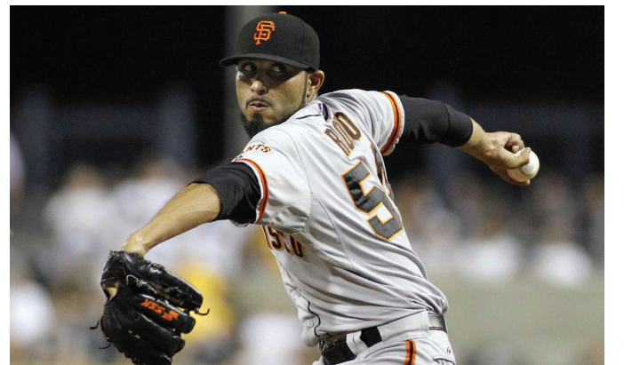
Sergio Romo played in San Francisco for nine seasons and helped the Giants win three World Series titles.