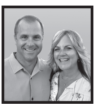
Oregon Licensed Real Estate Brokers

3975 River Rd N • Suite 3 • Keizer 🖪 MLS 🖻