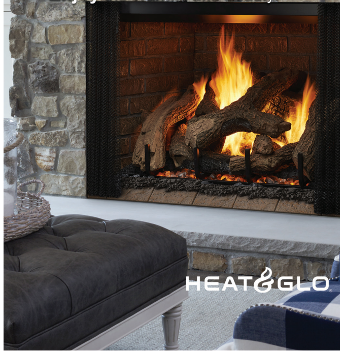
Pictured: The Phoenix Trueview Gas Fireplace with Stafford Interior Panels

Choose Your Hearth or Outdoor Product Relax While We Handle All of the Details Enjoy the Warmth and Beauty!