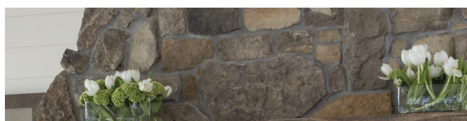
Introducing our Turnkey Shopping Experience

Measure 110, which reduces penalties on a number of drug-related infractions and diverts money to treatment programs, was passing with roughly 59% of the vote.