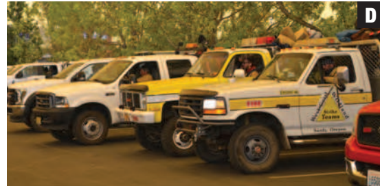
A and B: Photos of the McNary football field the morning of Sept. 4 and about four hours later. B and C: For a short time, fire crews were using Keizer Station as a staging area. D: Evacuees from fire devastated areas were beginning to trickle into Volcanoes Stadium Wednesday.

stepped up and offered meaningful action, support and comfort. That's who Keizer is," Clark said.