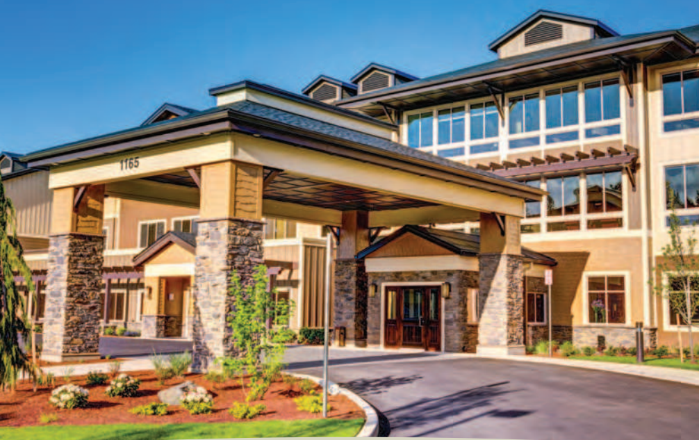
Quality senior living for those who have reached the age of sixty-two

Come See the Finest in Senior Living CALL (503) 390-1300