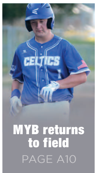
MYB returns to field PAGE A10