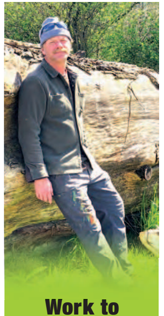
Work to begin on 2nd story pole PAGE A4