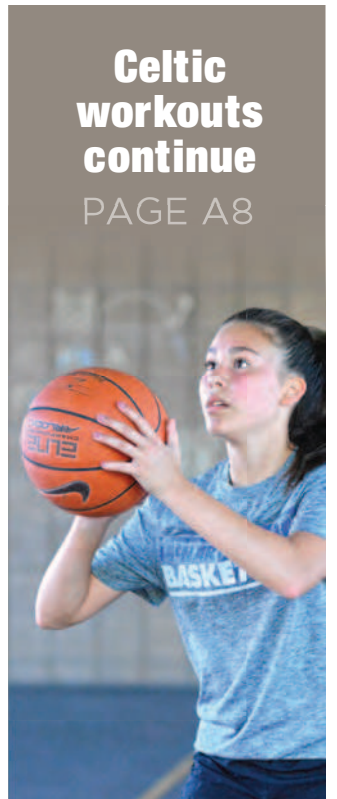
Celtic workouts continue PAGE A8