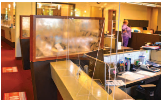
Clear shields at every customer service station were one way the city adapted to the pandemic crisis.