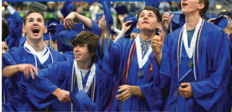
McNary grads from 2019 toss their caps in a more traditional ceremony.