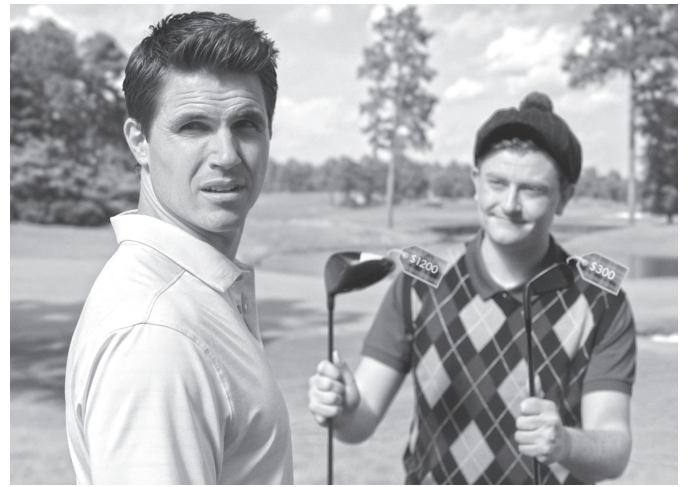
Robbie Amell, left, and Owen Daniels in Upload, a new comedy set in a digital afterlife.