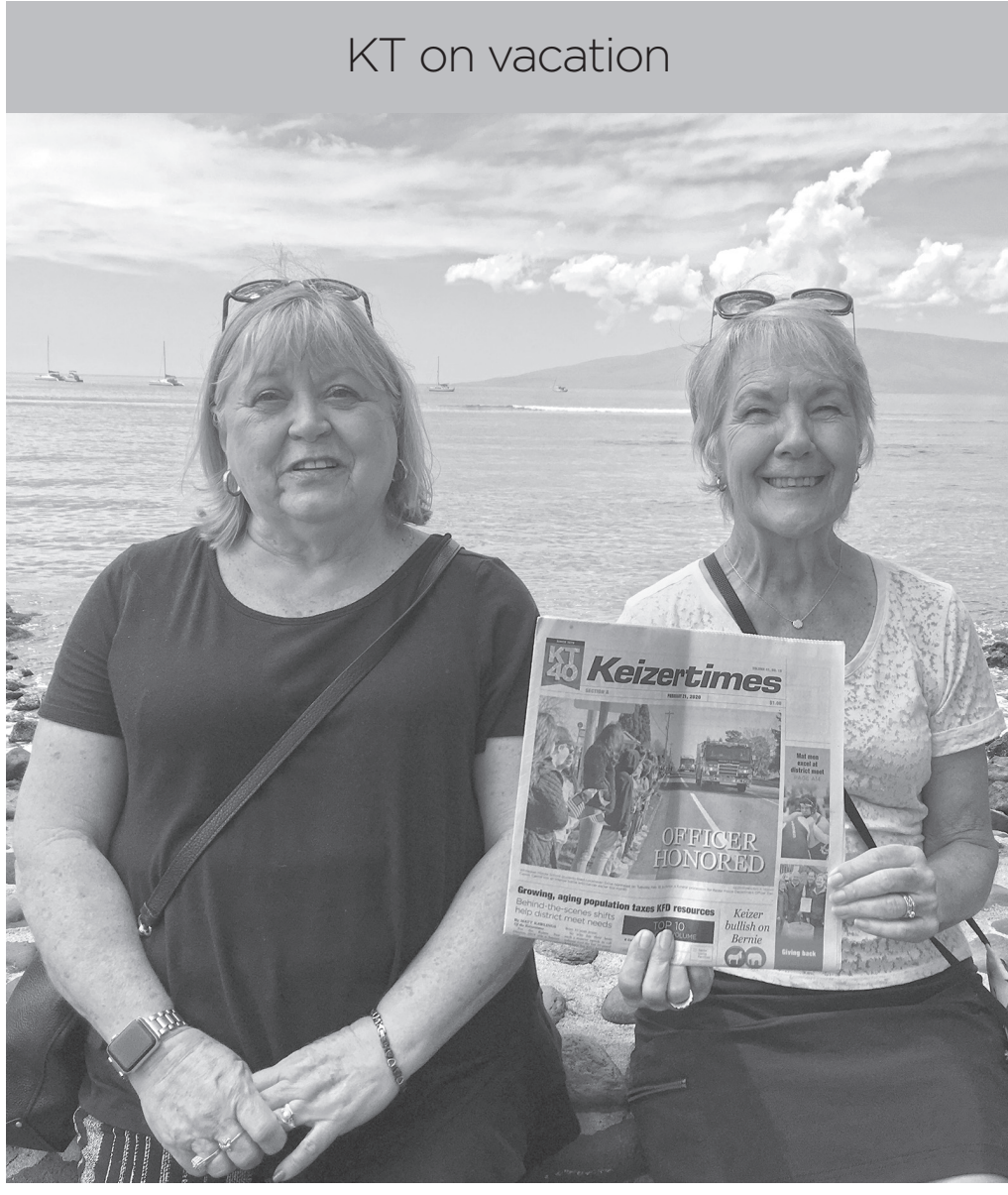
KT on vacation