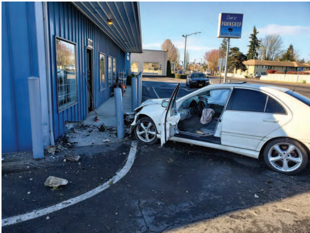
Submitted After a chase that was called off because of high speeds, a driver who attempted to elude police for a traffic stop crashed into bollards outside Dan's Pawn Shop.