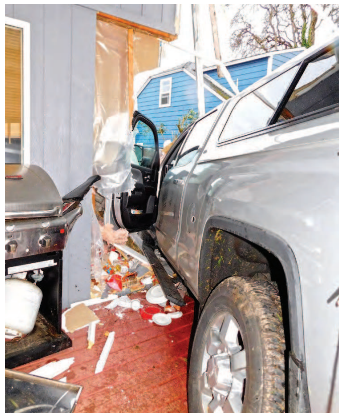
Submitted After shearing off a utility pole, the pick-up drove through the corner of a home and two fences before coming to a stop.