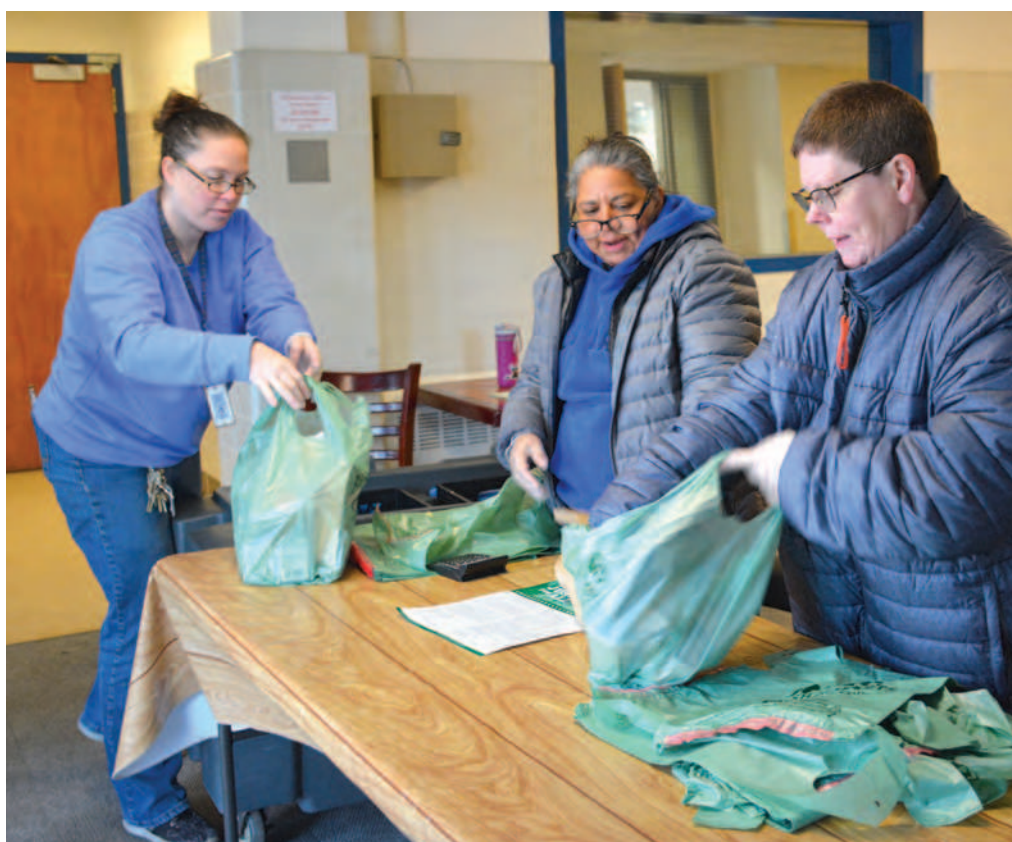
McNary High School staff members put together grab-and-go lunches being supplied by the Salem-Keizer School District during the COVID-19 crisis.

The state of emergency order cancels all public meetings through April 15. There is an option to extend the declaration.