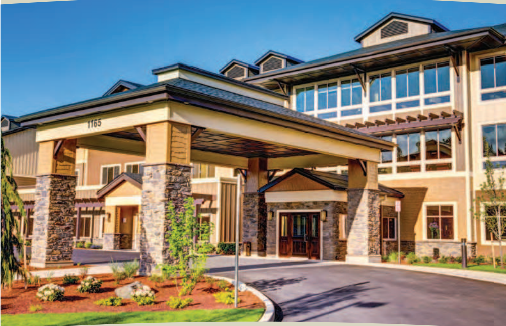
Quality senior living for those who have reached the age of sixty-two.

Come See the Finest in Senior Living CALL (503) 390-1300