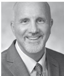
from the capitol By BILL POST

(Bill Post represents House District 25. He can be reached at 503-986-1425 or via email at rep.billpost@oregonlegislature.gov.)