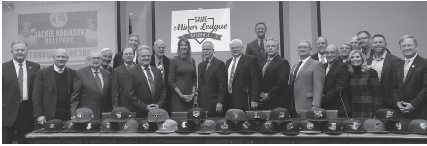
Multiple Minor League Baseball representatives, owners and members of Congress pose for a group photo on Capitol Hill.