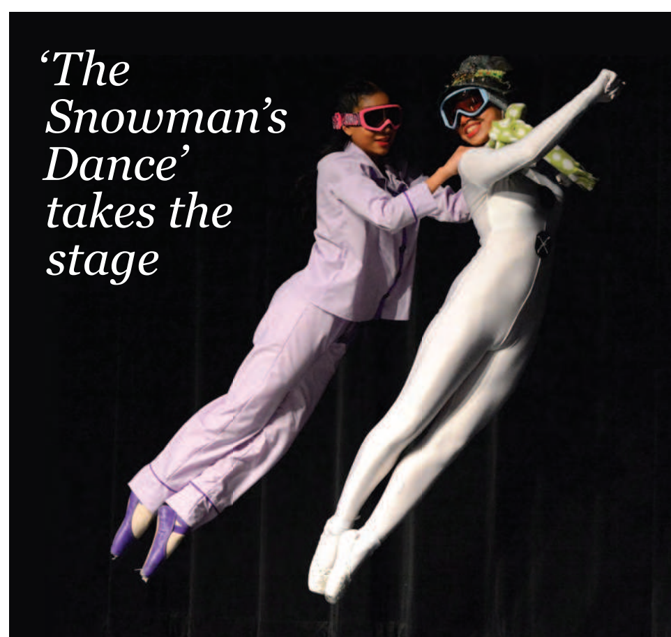
'The Snowman's Dance' takes the stage