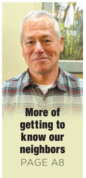
More of getting to know our neighbors PAGE A8