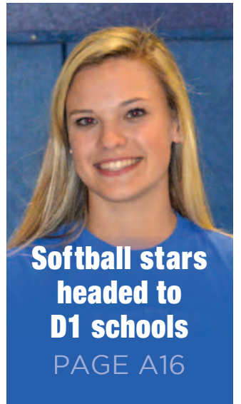
Softball stars headed to D1 schools PAGE A16