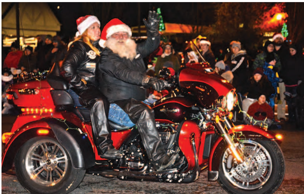
A motorcycle club thunders down the road in 2018 as part of the parade.