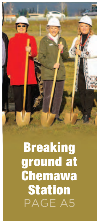
Breaking ground at Chemawa Station PAGE A5