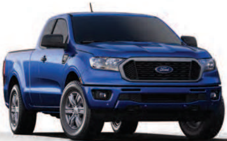
△ No purchase necessary. Anyone that drives a vehicle can enter to win $1000. One winner will be drawn on January 3, 2020.

NOW THROUGH JAN. 2 TEST DRIVE ANY VEHICLE AND ENTER TO WIN $1,000 TEST DRIVE GIVEAWAY △