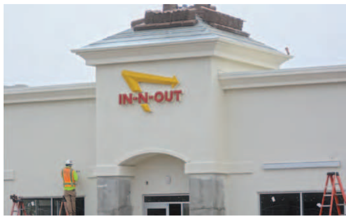
File In-N-Out appears headed for a mid- to late December opening.

"I believe it is going to be very busy, but manageable given [In-N-Out's] willingness to expend whatever resources