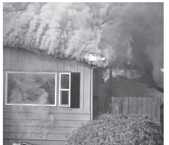
A fire decimated the home of the property manager in McNary Oaks Mobile Villa on the afternoon of Oct. 30.