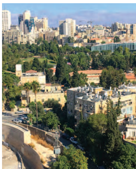
Submitted The City of Jerusalem as seen from the YMCA Tower.

We went to the portion of the Western Wall where people gather to pray, which was an incredible sight. We also visited the Western Wall tunnels, which were excavated under the West-