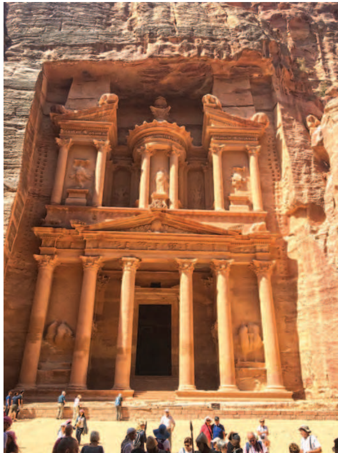
Submitted An outside view of the Petra Treasury, a temple built in the 1st Century AD.

We visited a replica of the Tabernacle (the place where God dwelled before they built the First Temple) that explained how the temple was to be set up and the significance of every piece inside, ev-