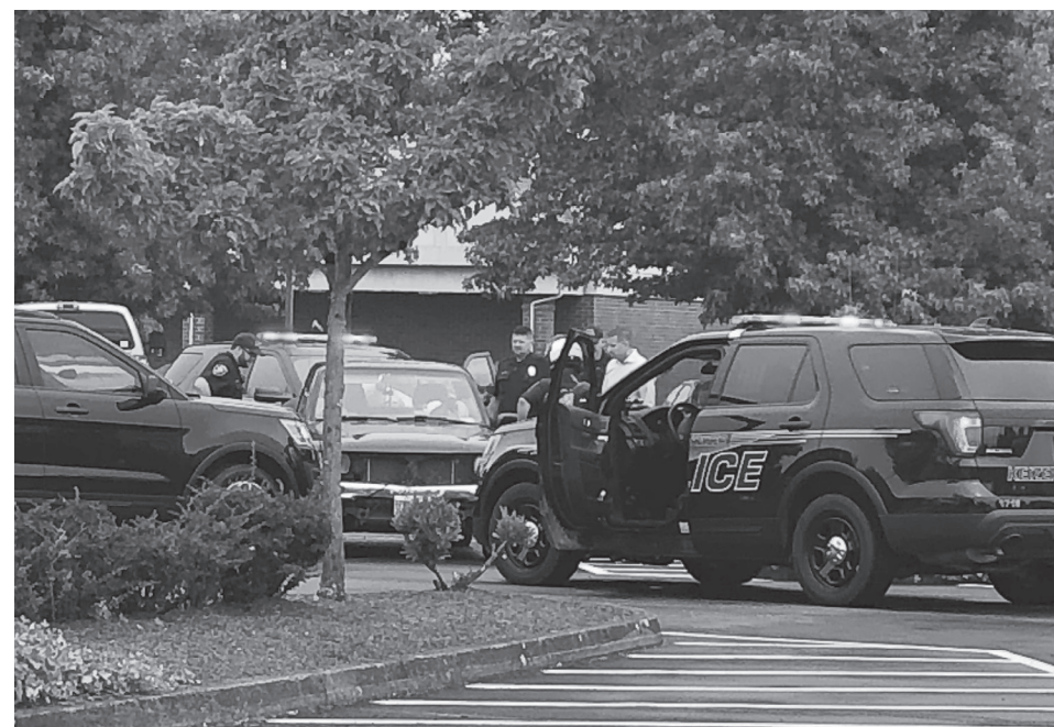
About 11 a.m. on Friday, Aug. 2, Keizer police confronted a man in the parking lot of Safeway on River Road North after it was alleged he brandished a machete out of the window of his moving vehicle after cutting off another driver and then brake-checking him. Officers could not establish a crime had been committed and no charges were filed.