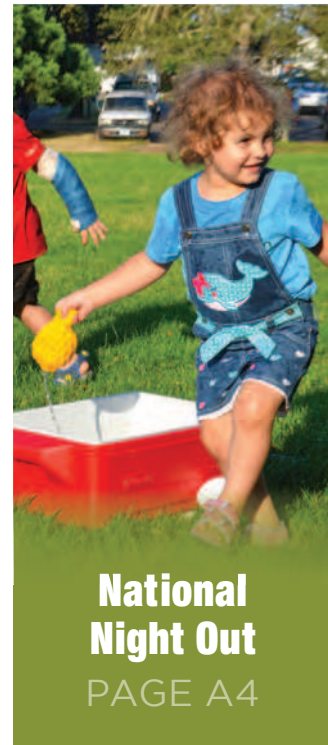
National Night Out PAGE A4