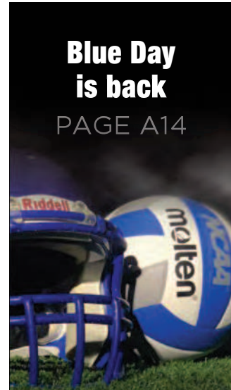
Blue Day is back PAGE A14