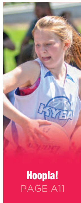
Hoopla! PAGE A11