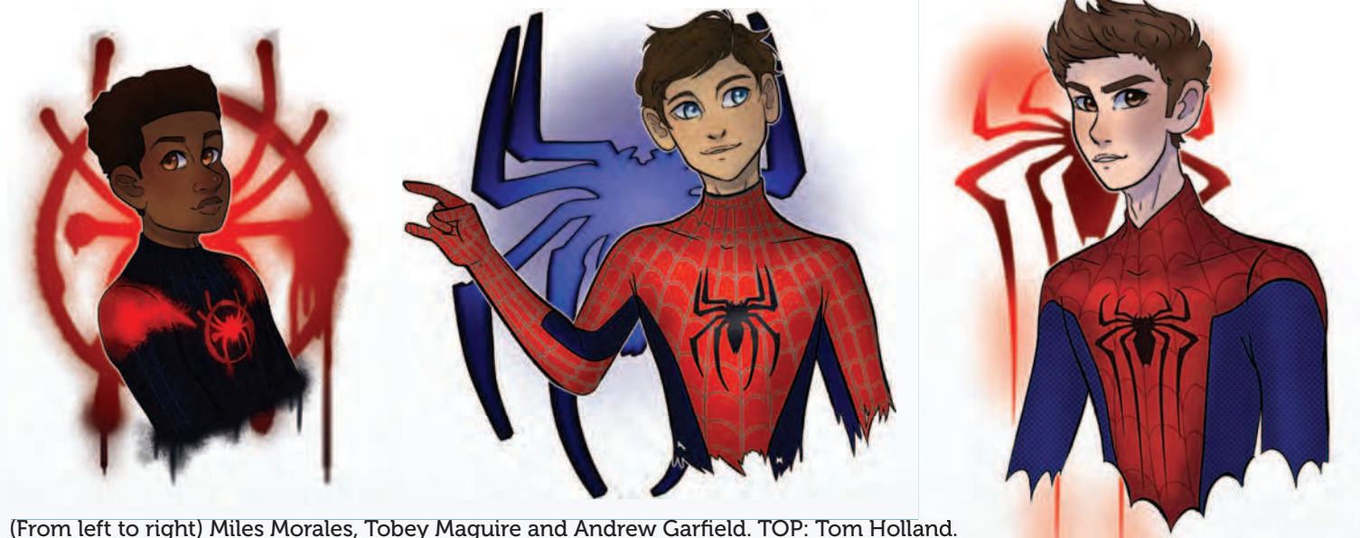
(From left to right) Miles Morales, Tobey Maguire and Andrew Garfield. TOP: Tom Holland.

In December of 2018, Spider-Man: Into the Spider-Verse was released which had a variety of voice actors playing a variety of Spider-People. Shameik Moore played Miles Morales, the movie's main character. Peter B. Parker, Morales' mentor was played by Jake Johnson. Gwen Stacy's Spider-Gwen was played by Hailee Steinfeld. Other adaptations of Spider-Man found in the movie are, Spider-Ham (John Mulaney), Peni Parker (Kimiko Gleen), and Spider-Man Noir (Nicolas Cage).