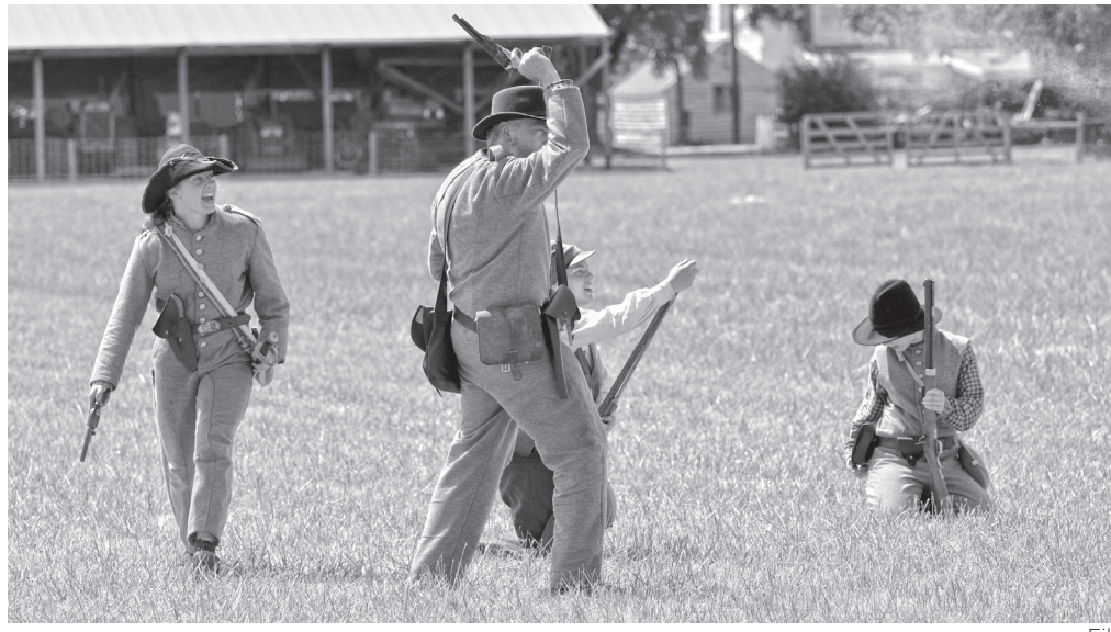
Union soldiers fend off an advancing Confederate regiment in a battle last year at Powerland Heritage Park.

Medical demonstrations are scheduled after each battle. Parlor talks are planned for 1 p.m. daily, and Abraham Lincoln will be a featured guest at the parlor talk Saturday, July 6. Fashion shows are held daily at 3 p.m.