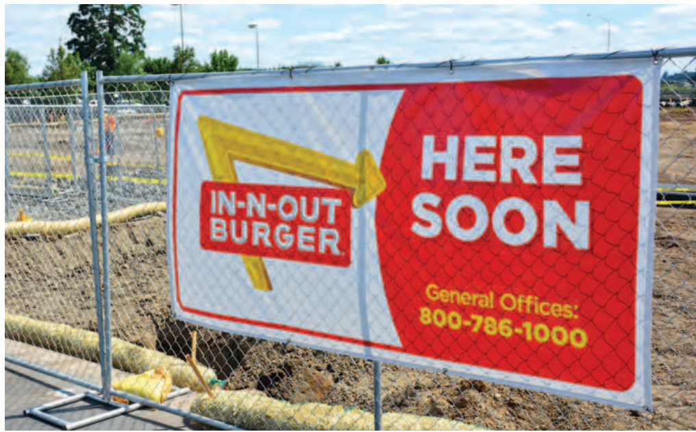
Construction of In-N-Out began in earnest earlier this month. Expect a sixth-month wait to order that double-double.