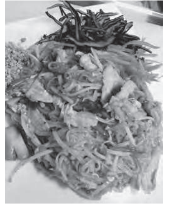
Pad Thai prepared by Bai Bua Thai Kitchen now open on River Road N.

The restaurant is open from 11 a.m. to 3 p.m. and from 4