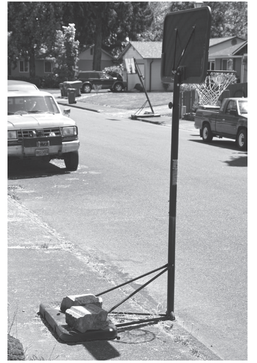
City officials are looking to make sidewalks throughout Keizer more accessible for their intended purpose and it might mean basketball hoops will need to be removed when not in use.

"We already know our code enforcement officer is overwhelmed. I want to be able to give him another tool rather