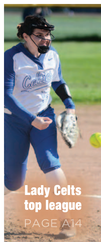
Lady Celts top league