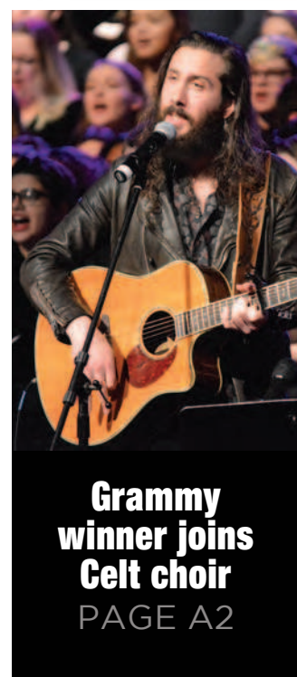
Grammy winner joins Celt choir