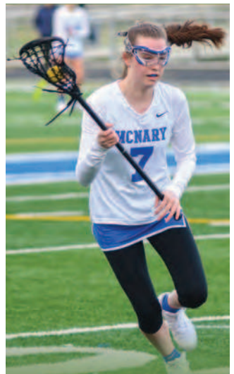
Girls lacrosse PAGE A16