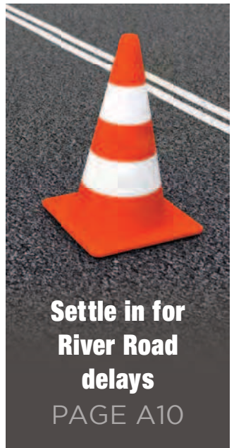
Settle in for River Road delays PAGE A10