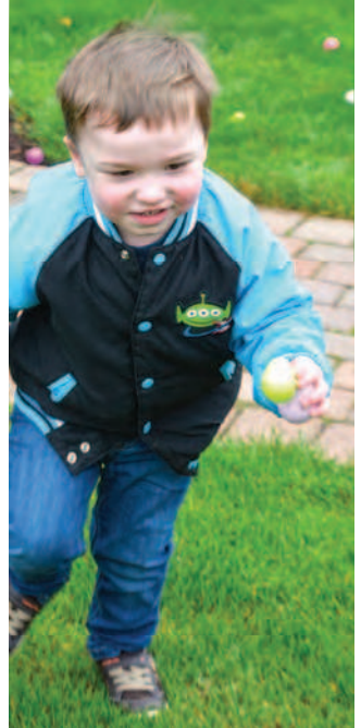
Easter fun for all ages PAGE A3