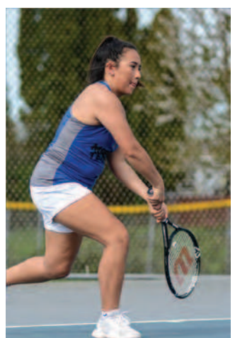
Girls tennis pulls out win PAGE A12