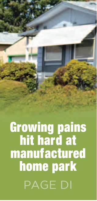
Growing pains hit hard at manufactured home park PAGE D1