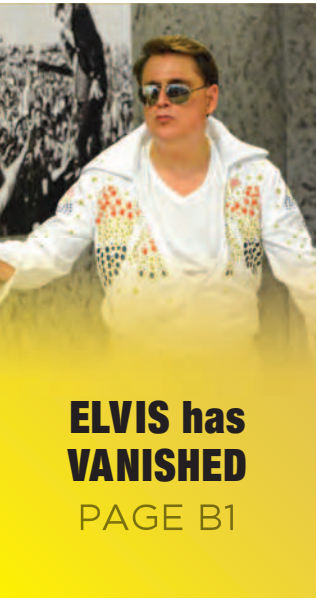
ELVIS has VANISHED PAGE B1