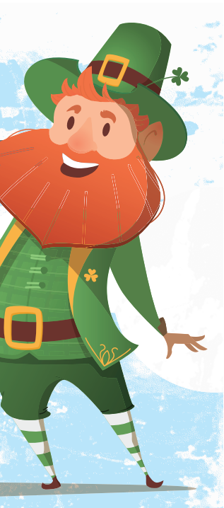
Check out kids' pages PAGE D4 & D5