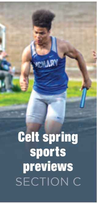
Celt spring sports previews SECTION C