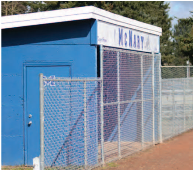
The McNary softball program will have to do away with the brand new dugouts they installed two years ago as they will begin playing on their new field by Saint Edward Catholic Church in 2021.