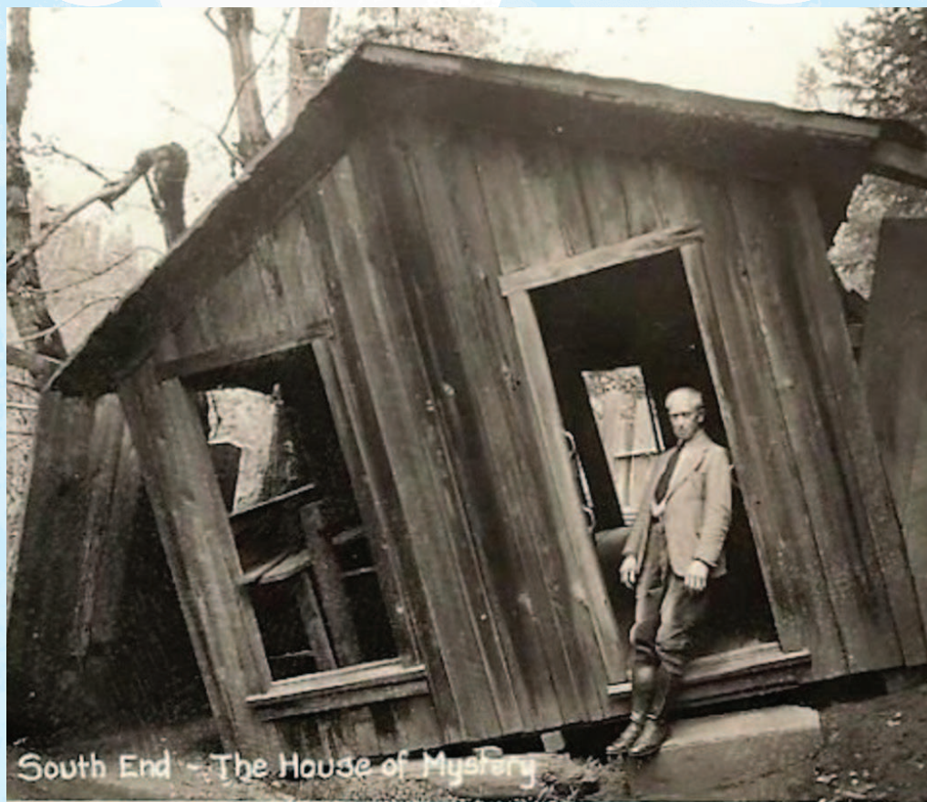
South End - The House of Mystery at the Oregon Vortex in Gold Hill, Ore.