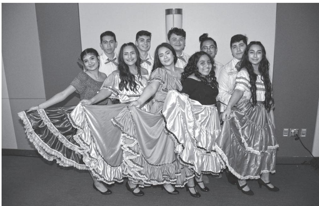
Members of the McNary High School Latino Club welcomed and performed for attendees at the annual Keizer Chamber of Commerce First Citizen Award Banquet.

MIDDLEWEIGHT TITLE FIGHT 9 FIGHTS IN ALL ON THE HUGE SCREEN Live Fights at 5:00 (21 & Over) - Tickets $13 Reserved Seating Available Now Online.