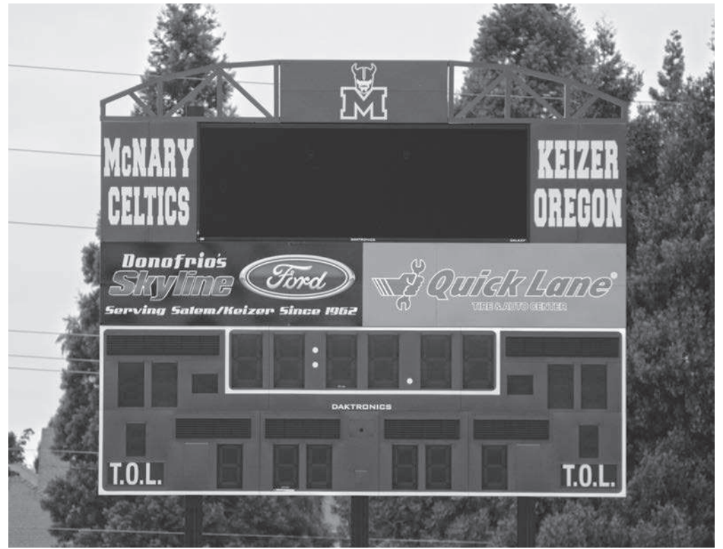
The new scoreboard at McNary High School was unveiled over the summer.