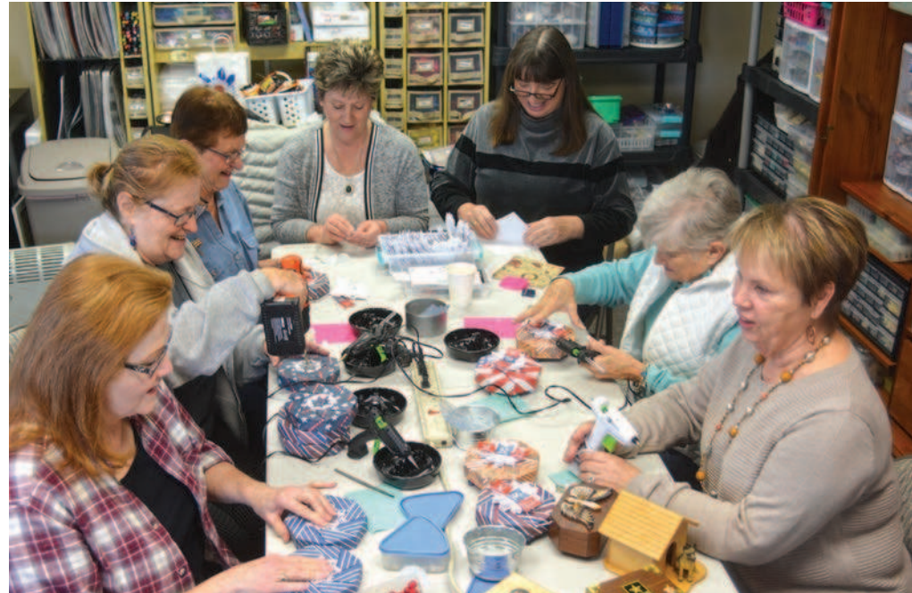
A group of ladies, known as Music Box Angels, construct music boxes to be delivered free to show people that someone loves and cares about them.