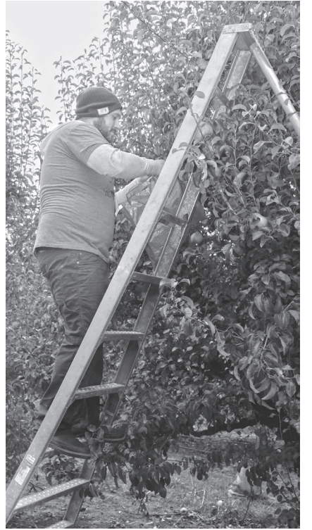
A volunteer harvester picks pears in an orchard north of Keizer.

The short time it takes in getting food from field to food bank is one of the