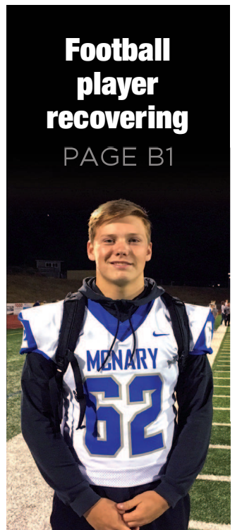
Football player recovering PAGE B1