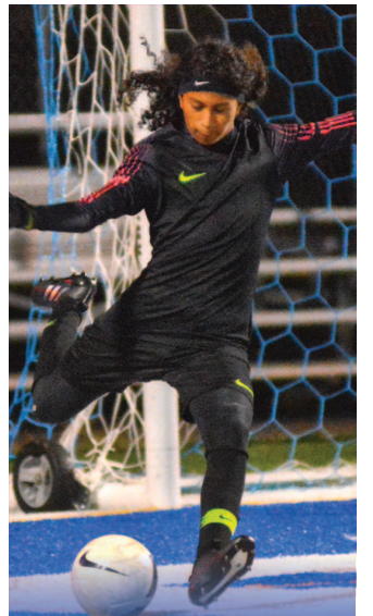
Boys soccer on fire PAGE B1

In addition, the council Please see LAWSUIT, Page A7