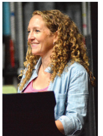
Music moves at MHS PAGE A3