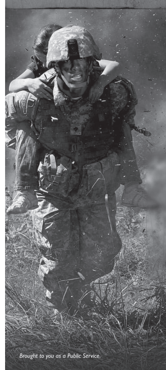
Brought to you as a Public Service.