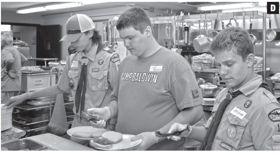
Members of Boy Scout and Cub Scout Troop 105 served food and waited tables at the monthly Community Dinner at St. Edward Catholic Church.