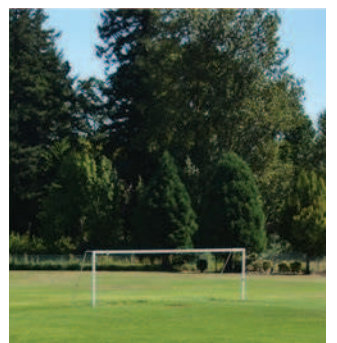
City to water CCMS fields? PAGE A10