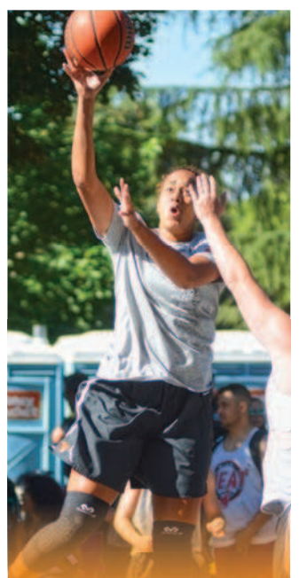
Keizer women dominate Hoopla PAGE B1

This is the final part of a continuing series in the Keizertimes investigating the state of local foster care and shedding light on ways to get involved.