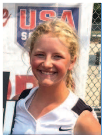
Lady Celts shine on diamond PAGE B1