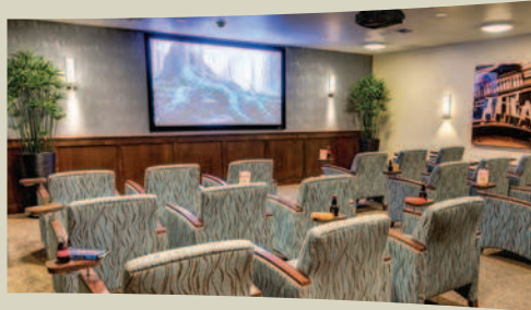
Quality senior living for those who have reached the age of sixty-two.

Come See the Finest in Senior Living! CALL (503) 390-1300