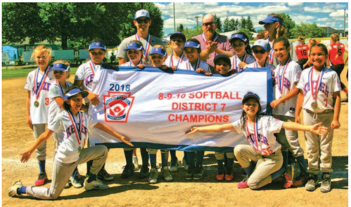
Keizer Little League's 8-9-10 year old All-Star softball team defeated Dallas on Saturday, June 23 to win the District 7 Championship at Keizer Little League Park.