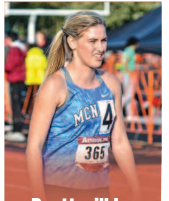
Doutt will be two-sport athlete at George Fox PAGE B1