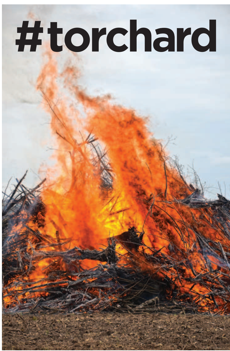
#torchard Piles of dead filbert trees went up in smoke at Keizer Rapids Park last week as volunteers made way for a local farmer to begin harvesting grass seed in the 20-acre area in the east section of the park.