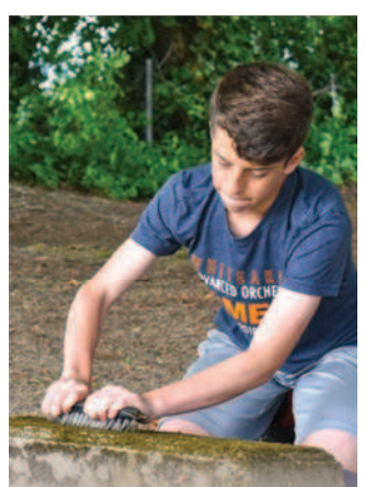
Cemetery clean-up PAGE A8