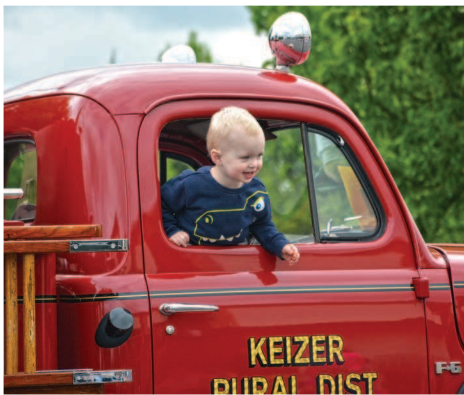
The Keizer Fire District and its employees and volunteers are the grand marshals for the parade this year. KFD is celebrating its 70th anniversary.