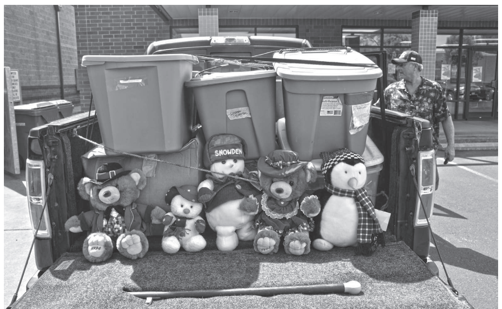
Three strangers assisted Allen Barker in rescuing stuffed animals from Interstate 5 after three plastic containers fell off the back of his truck while driving home from Lebanon.